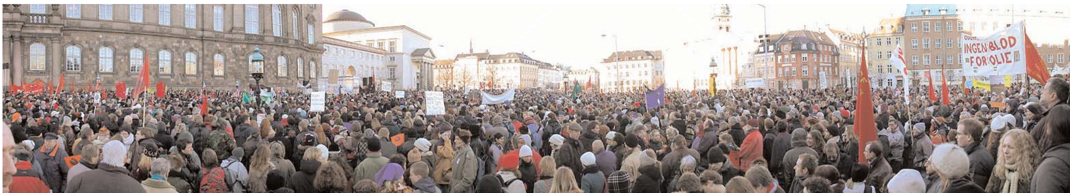
Copenhagen against war, February 15th 2003.

There will also be music, theater, films, paintings - art and culture from all over the globe There are great facilities for sport, media workshops, big parties and small intimate places to meet.