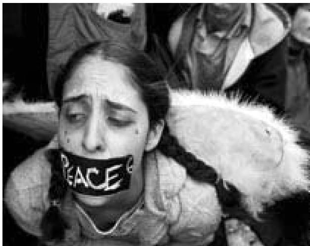
The First Victim is Truth

The joint actions of millions of people opposing the war against Iraq and against imperialist globalisation has shown that it is possible to join the whole world together and create our own future.